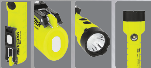
Built in pocket/belt clip with integrated magnet